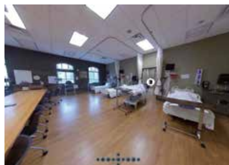
In addition to offering online guided tours with an ambassador, Southern is developing a self-guided virtual tour that will allow prospective students to explore campus, including building interiors.

To schedule a virtual visit, simply go to southern.edu/visit and select appointment times, or send an email to visit@southern.edu and a member of the Admissions team will be in touch. Parents and other family members are always welcome to join tours, whether virtual or in person.