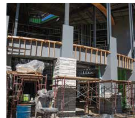
Despite delays caused by the pandemic and bad weather, progress continues on the Bietz Center for Student Life, which is expected to open in spring 2021.