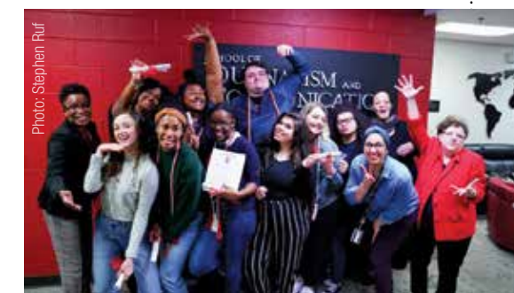
Graduating seniors and their professors in the School of Journalism and Communication enjoyed an impromptu celebration.

In the School of Journalism and Communication, professors and staff members organized a mock graduation