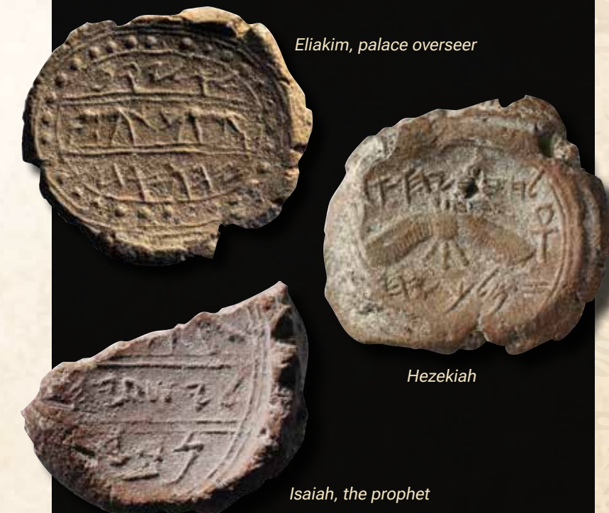
Eliakim, palace overseer

Seals that mention people from the Bible are particularly significant, because they offer proof that these were real people who lived. The Lynn H. Wood Archaeological Museum exhibit Peace and War: The Assyrian Conquest of Lachish includes a seal that reads “Ushna, the servant of Ahaz,” referring to Ahaz the King of Judah and father of Hezekiah. The museum also contains seal impressions of Hezekiah and Isaiah, which were found in Jerusalem in 2015. The two seals were unearthed about nine feet away from each other, in the same strata, lending validity to the Bible, since Isaiah was the prophet of Hezekiah’s time.