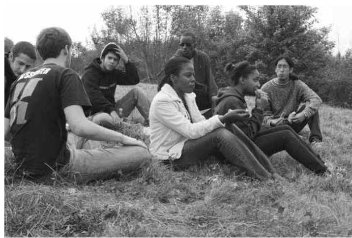
Waiting for birds at Whigg's Meadow.