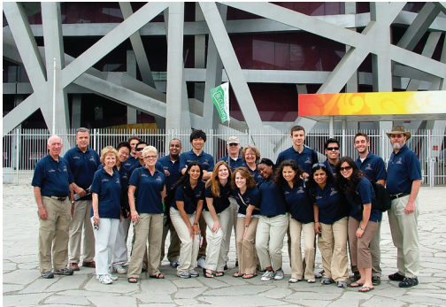
The 2009 study group in front of the Bird's Nest venue of the Beijing Summer Olympics 2008