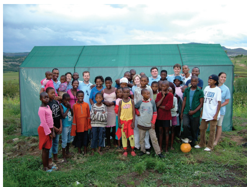
Three SIFE teams and orphans in front of completed greenhouse in the village of Popopo.

The village of Popopo has 100 families who will benefit from the greenhouse, out of that 165 are orphans. Tiping has 130 families and 72 orphans that will benefit. Project Hope was a success because three greenhouses were completed and the villagers were educated.