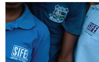
Three SIFE teams working together

These greenhouses in the village of Popopo and Tiping and on the campus of Maluti Adventist Hospital, provide hope by supplying