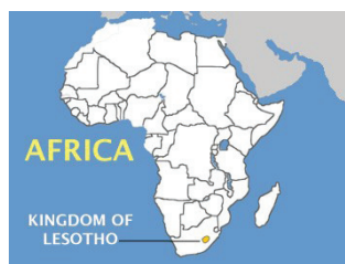
Lesotho is a small country located within South Africa

Lesotho is an impoverished country in Africa. Its main source of nourishment is maize meal