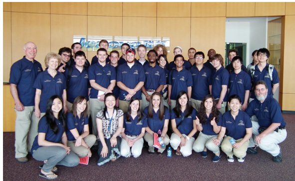
The group at the Lenovo Plant in Shanghai

cient Town-one of the World Cultural Heritage-and enjoyed a Dongba traditional music show. In Shangrila,