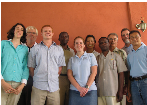
Students with AHS-ECD executives in Arusha Tanzania

Heri Adventist Hospital is very remote, and we were able to do so much more than what would be allowed in an