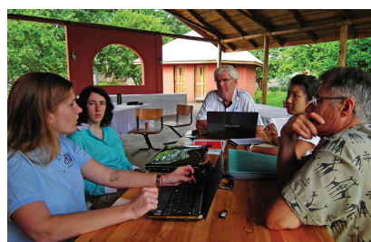
Working at the ADRA offices in Arusha, Tanzania

After receiving our report, the AHS-ECD CEO emailed: "Thank you for preparing and emailing your recommendations. This is a very impressive document, very detailed and accurate. I am very impressed. I was not expecting such a document. You must have all worked very hard after you left."