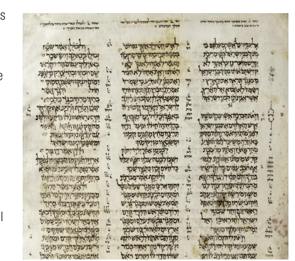
Riblical Hebrew Manuscript

Let's look at what God himself has to say about the creation of this world. In Exodus 20, the actual words of God are recorded. These are the commandments that He proclaimed in a loud voice to the children of Israel at Mount Sinai. Here God states, "Remember the sabbath day, to keep it holy ... For in six days the Lord made heaven and earth, the sea, and all that in them is, and rested on the seventh day" (Exodus 20:8, 11).