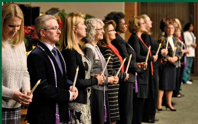
Dedication service at the end of fall semester (above and below)

As employees and students all headed different directions at Spring Break, knowing that they would not all be back together that semester due to the pandemic, the faculty and staff committed to maintaining the sense of community. They continued to reach out to the nursing students in different ways to stay connected through Zoom and social media. The entire department looks forward with much anticipation to the return of nursing students in the fall!