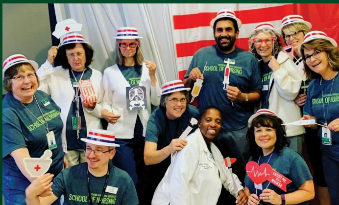
Welcome Back to School celebration in the School of Nursing