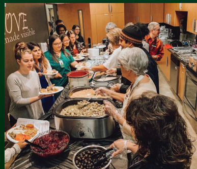
Thanksgiving meal served by staff to students