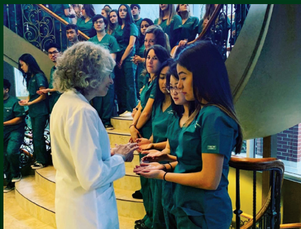
Blessing of the Hands ceremony held in the front foyer of AdventHealth Hall