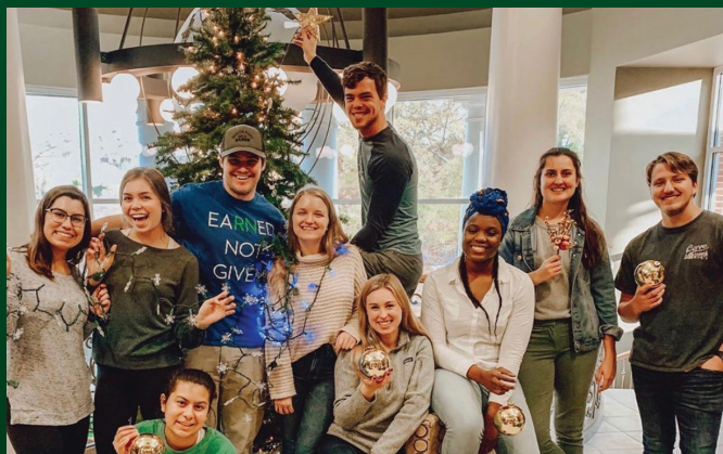
Students decorating AdventHealth Hall for Christmas