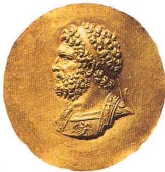
Philip II of Macedon

The Institute of Archaeology announces the development of a new exhibit, "Faces of Power: Ancient Coins from the Biblical World," brought about by the reception of a rare coin collection from the Bechtel family.