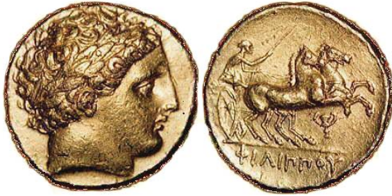
Gold Stater of Philip II