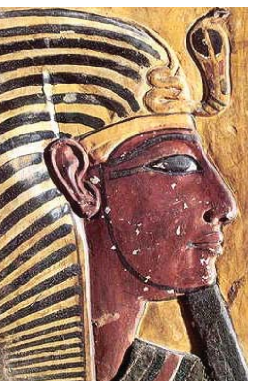
King Seti I

The museum will be open one hour prior to the Museum Lectures. Meet our guest lecturer and enjoy a special guided tour of the museum.