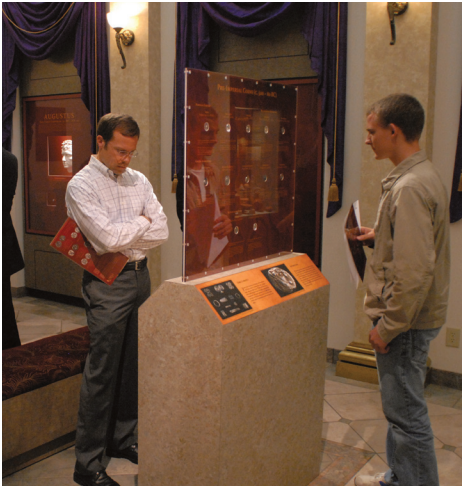
Visitors examine ancient coins at the Faces of Power coin exhibit.