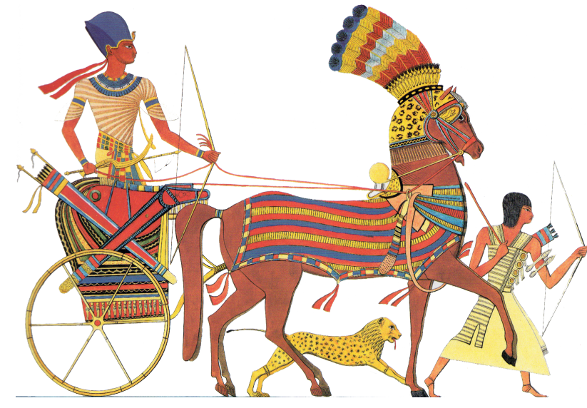
A battle ready Ramesses II riding a war chariot, preceded by an archer. Illustration by Ippolito Rosellini from the Abu Simbel temple.

The fourth seminar course, "Sanctuary, Temple, and the Archaeology of