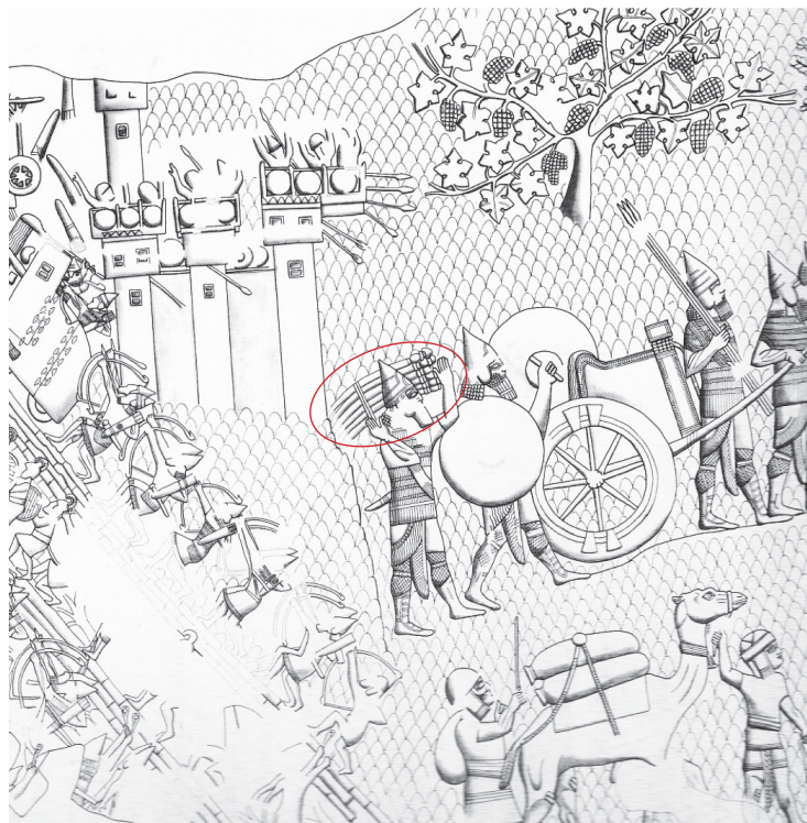
Scene from Assyrian palace wall reliefs depicting the enemy (possibly Israelites) carrying curved swords.

In earlier reliefs from Sargon II's palace at Dur-Sharrukin (P.E. Botta and M.E. Flandin. Monument de Ninive . Paris: Imprimerie nationale, 1849), depictions of battles depict the Assyrians again with straight swords, but the enemy is shown carrying curved swords at their sides. Franklin ("A Room with a View: Images from Room V at Khorsabad, Samaria, Nubians, and the Brook of Egypt and Ashdod." In A. Mazar (ed.) Studies in the Archaeology of the Iron Age in Israel and Jordan . Sheffield: JSOT Press, 2001) has argued that these scenes depict the siege and battle against Samaria citing the parallel curved swords in Sennacherib's reliefs as well as the fact that chariots were one of the major elements of that battle. If these curved blades are indeed swords from the region of Judah and Israel, then the Qeiyafa blades represent the earliest indication of this type of sword in the archaeological record.