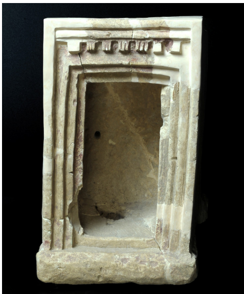
Portable stone shrine from Khirbet Qeiyafa. Note the recessed opening and the decorative three-plank (triglyph) ‘roof beams.’ The opening is twice as tall as it is wide.