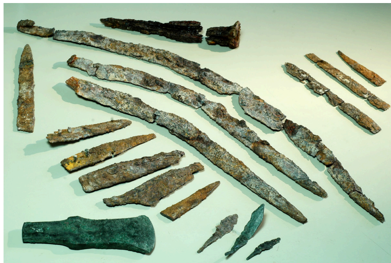
Cache of iron weapons and tools discovered at Khirbet Qeiyafa between 2009 and 2012. Note the three long blades in the center that may be early examples of Judean/Israelite curved swords.

However, all of the sickle blades found at Iron Age sites in Judah and Israel differ from the Qeiyafa blades in at least one way—their size. The largest sickle blade from Hazor is only 28 cm and most of them average around 18–21 cm in size, less than half the smallest Qeiyafa blade. The longest Qeiyafa blade is three times longer than this average. Are these blades simply large sickles? If so, they would be unparalleled among later Judean and Israelite cities. In