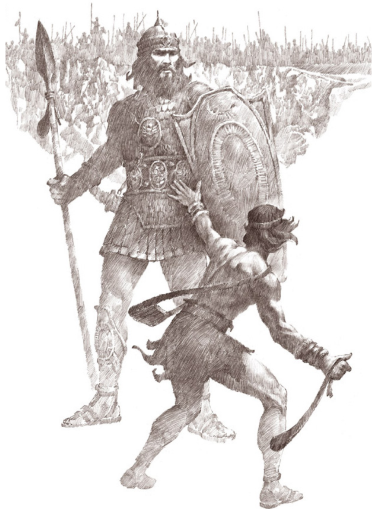
Illustration David and Goliath.

May each of you enjoy this season as we reflect on the past, knowing that because of it, our present and future is filled with promise. 🍷