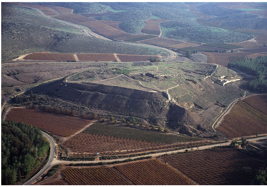
Aerial photograph of Tel Lachish (a.k.a. Tell ed-Duweir) from the Northwest.

Museum has on display the extensive reliefs from Sennacherib's palace at Nineveh showing in detail the attack against Lachish. These reliefs show a siege ramp built against the city while it is attacked by Assyrian battering rams." The detail of the reliefs has been analyzed and compared with the archaeological evidence uncovered in Level III of Lachish itself where the actual siege mound was uncovered. Here hundreds of arrowheads