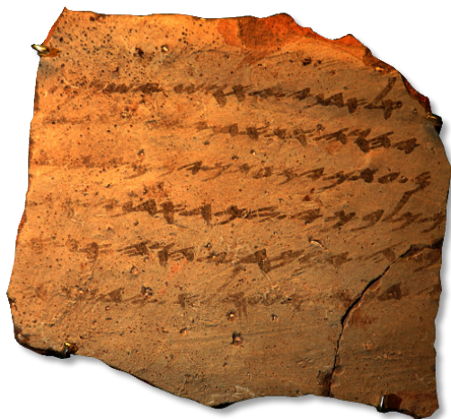
The Lachish letters (ostraca), written shortly before Lachish fell to Nebuchadnezzar's army in 586 BC, offer testimony to the final moments of the Kingdom of Judah.