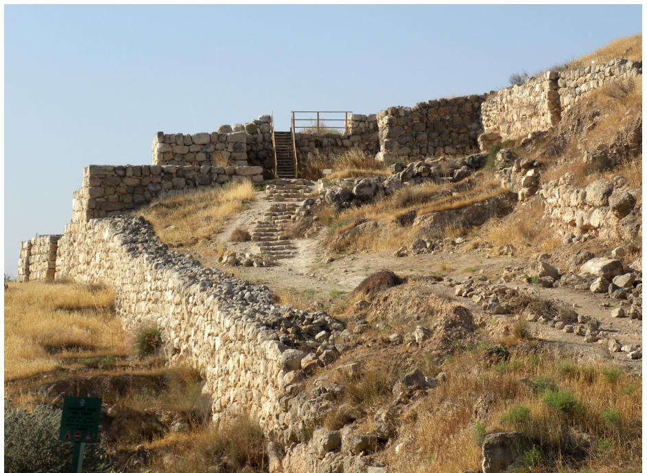
View of the city gate of Lachish. Lachish was one of principal fortified cities of Judah in the Iron Age. The city was famously besieged and destroyed by the Assyrians in 701 BC.

3. Illuminating Biblical History: Few sites have provided more data for the history of Judah than Tel Lachish in the later periods. The pilot excavations this summer will be probing for earlier evidence at Lachish from the time of Rehoboam, the son of Solomon and the relationship of Lachish to events in the rest of the region. Levels IV and V remain largely unknown except for a few small exposed areas. Finding and documenting Levels IV and V in a larger exposure will give us the missing link to the earlier history of Judah in the region. How was the city developed in this period? Were there fortifications and was there a major city gate at the northern part of the site? These are all questions that remain unanswered. After this long journey could it be that the Institute of Archaeology has been positioned for such a moment in history to continue to focus on the world of the Bible with the challenges we face in today's world? We solicit your support as we begin this project from July 14-July 29, 2013 and look forward to what awaits us under the sands of time. ✍