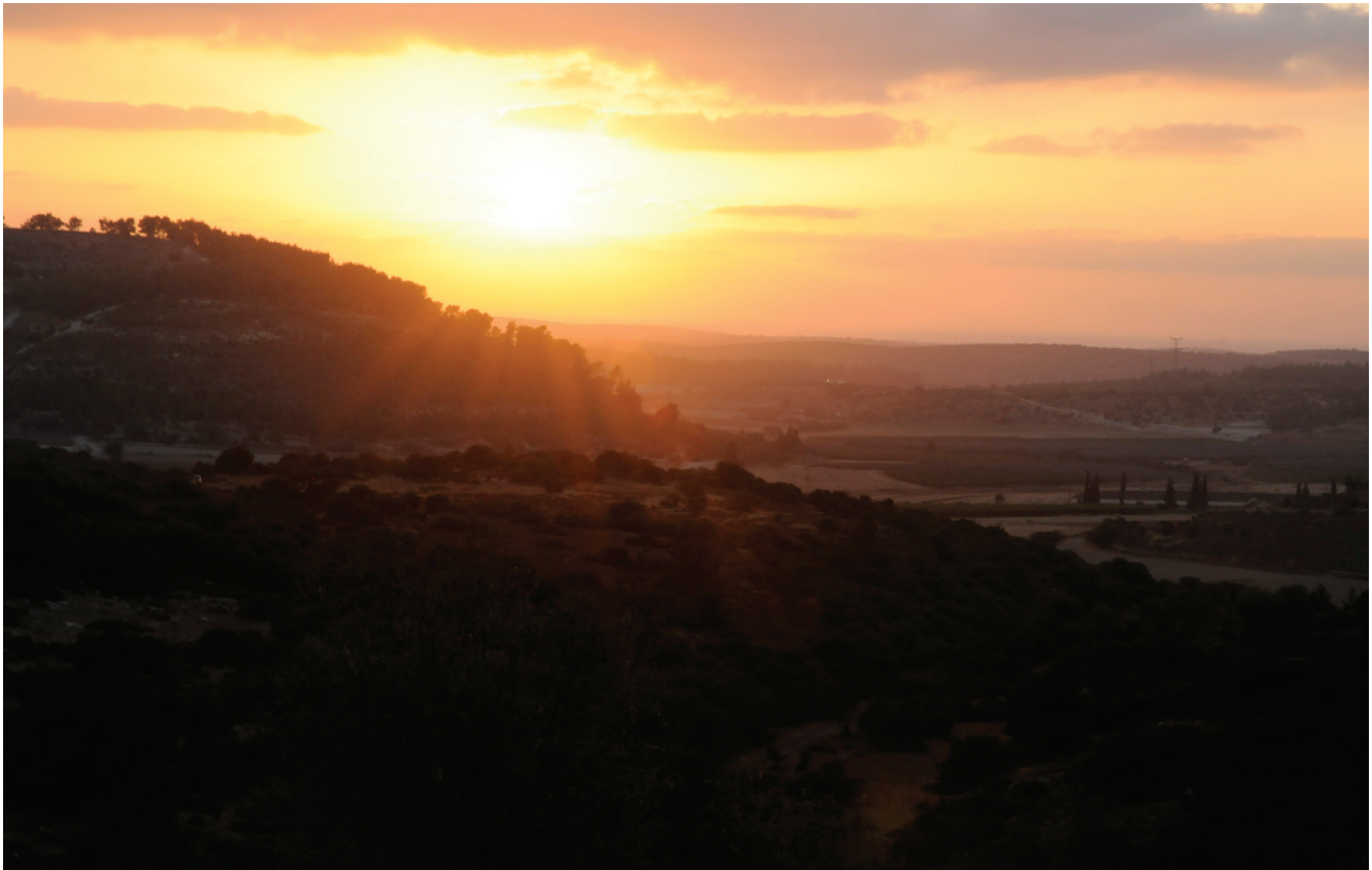
Sunset over the Elah Valley, marking the end of a seven-year expedition at Khirbet Qeiyafa.

During the final celebration, it was announced that Khirbet Qeiyafa is being considered to be included as a national park by the government of Israel. This will encourage many visitors to experience the importance of this relatively small garrison on the border of Philistia. 🍷