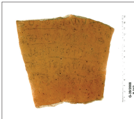
The “Qeiyafa Ostrakon.”

In any archaeological project, all activity comes immediately to an excited standstill when an inscription is discovered, be it in the field while excavating or in the camp during pottery washing. Suddenly a carelessly collected sherd turns out to be an ostrakon—a broken piece of pottery that has been used or reused as a writing medium—containing an inscription, sometimes consisting of a few roughly incised letters. At other times it could be an extensive text written in a beautifully flowing script by a trained scribe. The “Qeiyafa Ostrakon,” found in 2008 by the joint excavation of The Hebrew University of Jerusalem and Southern Adventist University at Khirbet Qeiyafa, bears testimony to the importance of inscriptions in biblical archaeology. It turned out to be the oldest Hebrew inscription found to date, containing a text replete with biblical terminology, even though it has not been deciphered in its entirety.