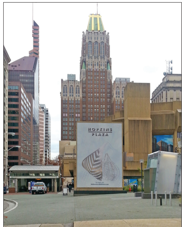
View of downtown Baltimore last month during the professional meetings.