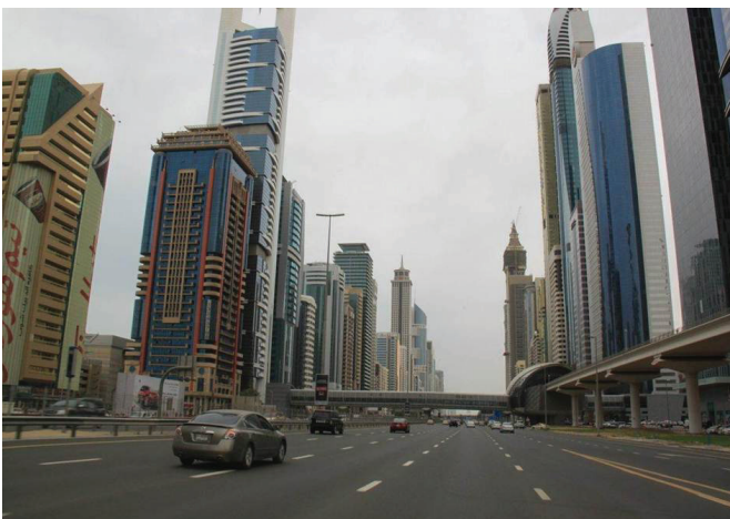
Driving down a main street in Dubai.