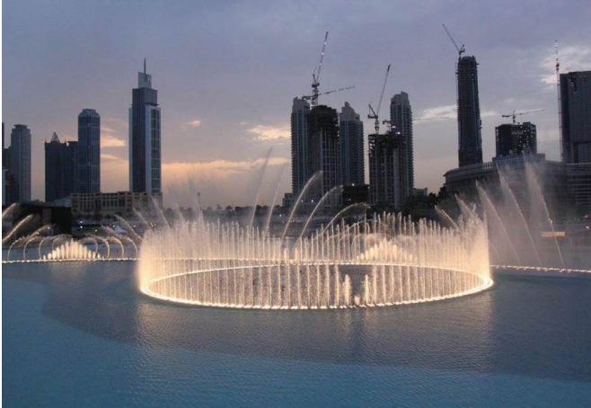
The $217 million fountain in front of the Burj Khalifa.