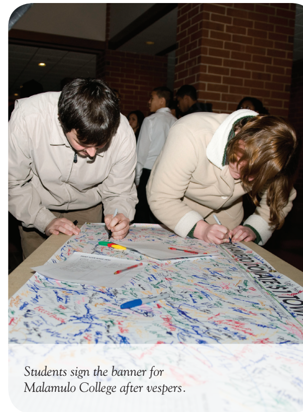
Students sign the banner for Malamulo College after vespers.

Southern has increased its fund-raising goal to $15,000 for the academic year.