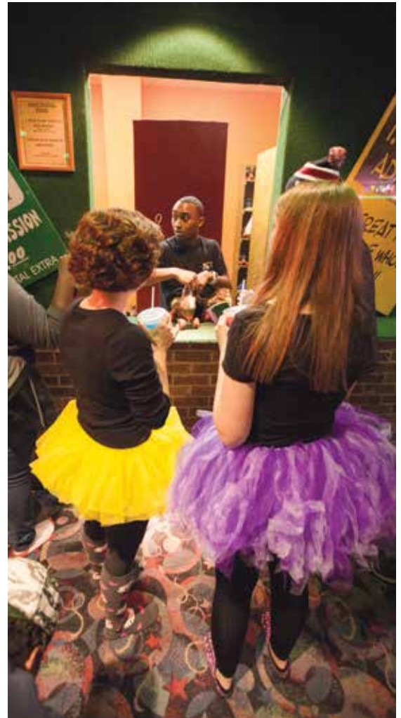
Some students got into the spirit of the event by dressing up in colorful tutus.