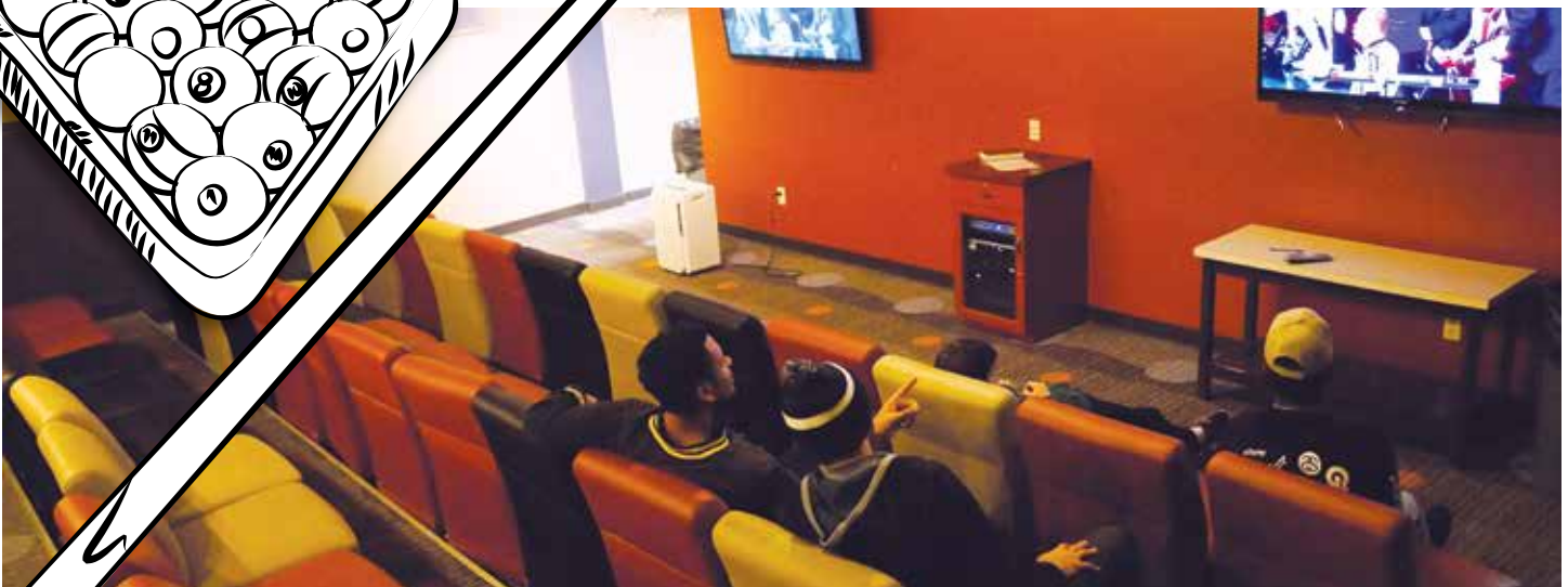
The men of Talge are invited to watch a movie or just lounge in the Recreation Room's spacious home theater. Though there is usually plenty of leg room, it can get pretty crowded during the Super Bowl and the NCAA Basketball Tournament!