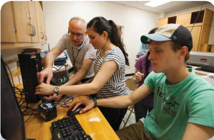
Physics students measure the properties of light with a state-of-the-art spectrometer as part of their ongoing research into the atom's structure.

Southern makes sure each of its schools and departments has the latest educational and job-specific technology. Professors integrate the technology into their curriculum, allowing students to become familiar with the equipment they will utilize in future careers.