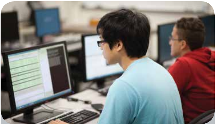
Mathematics students use the software Mathematica to assist in learning modern technical computing. With this program, they can build powerful algorithms.