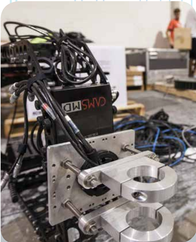
Film students use the School of Visual Art and Design's crane to capture scenes with lots of movement or shots from above.

Southern makes sure each of its schools and departments has the latest educational and job-specific technology. Professors integrate the technology into their curriculum, allowing students to become familiar with the equipment they will utilize in future careers.