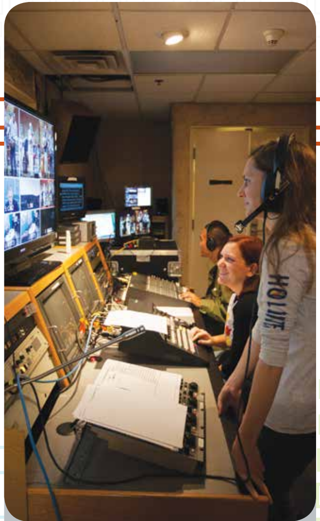
Broadcast journalism students direct SAU News, the campus newscast, from a control room. Students also learn to use camera equipment vital to work in their field.