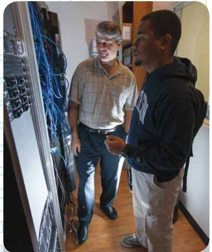
Computing students learn the complex make-up of a server room to help them manage technological systems.