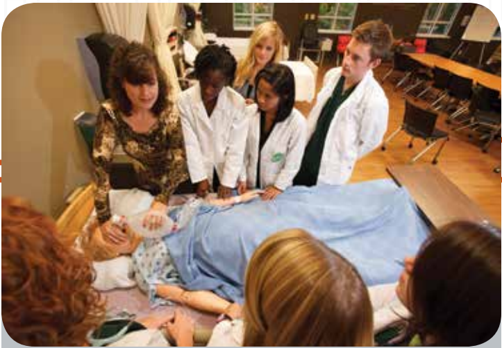
Nursing majors practice their medical skills on a training dummy in Florida Hospital Hall's simulation lab.