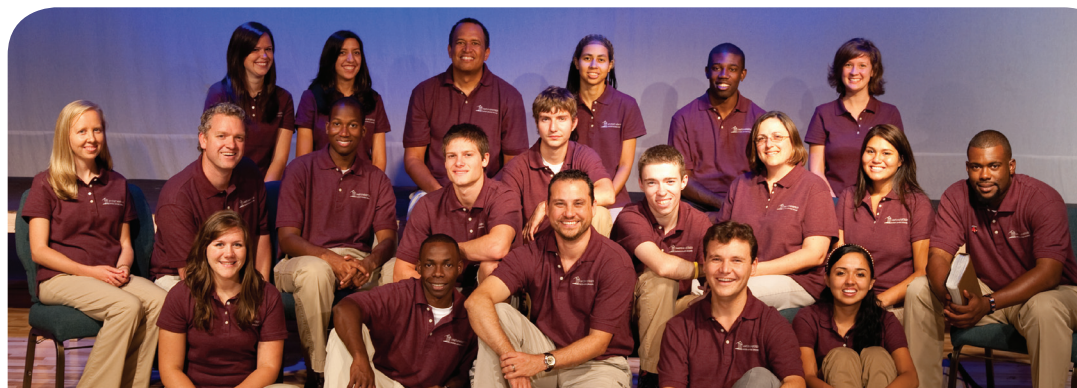
Students and staff who work in Southern's Campus Ministries Office