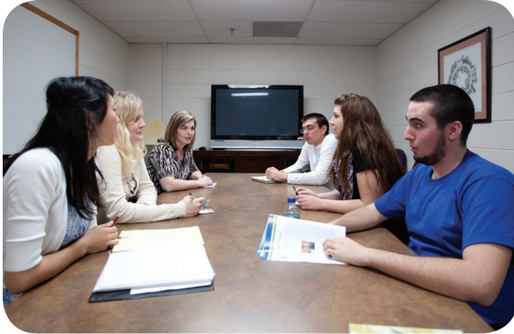
Student officers discuss current and future plans for SIFE projects.

With its 60 members, Southern Adventist University's Students in Free Enterprise (SIFE) club is using foundational business principles to address relevant social, economic, and environmental factors in order to further sustain communities, organizations, and the global society.