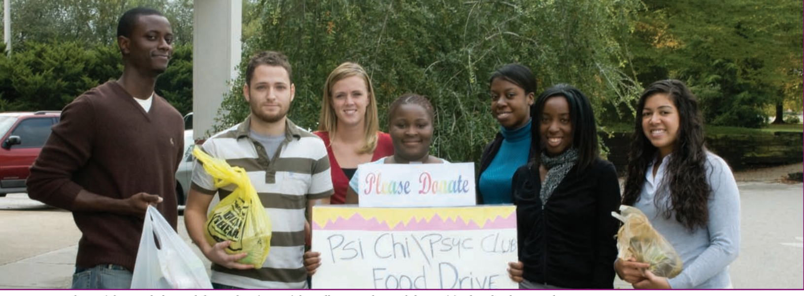
Members of the Psychology Club stand in front of the Village Market with bags of food and a donation box.