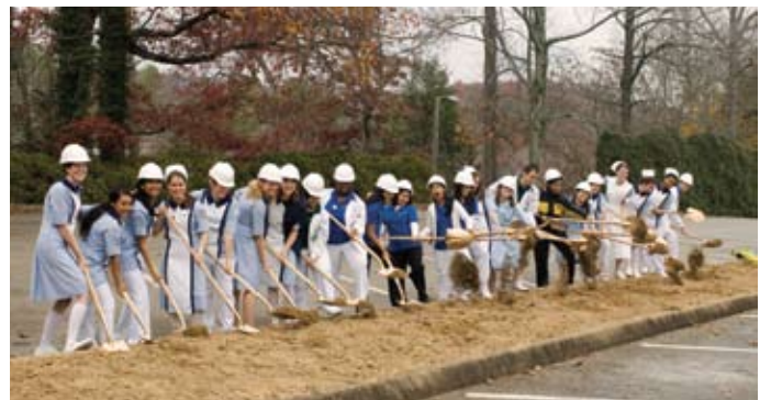
Southern nursing students break ground for Florida Hospital Hall.