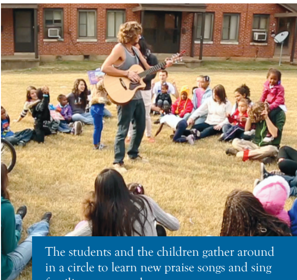
The students and the children gather around in a circle to learn new praise songs and sing familiar ones together.