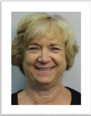
Beverly Rawson Planned Giving